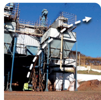
FREE FLIGHT (SEPARATION BY DENSITY)*

*Launching the beans in free flight over a drying yard will separate coffee and impurities by density: dense fall further, light fall nearer.