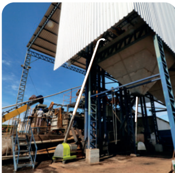
HOPPER AND ELEVATED SILO